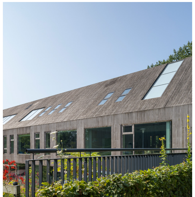
KRAAIJVANGER ARCHITECTS

For more details on cleaning Accoya cladding, please refer to our Wood Information Guide here .